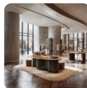
Underfoot Luxury: The Role of Flooring in Retail August 5, 2025