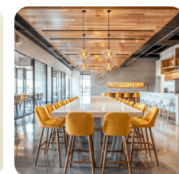
Scandinavian Workplace Cafeteria July 30, 2025